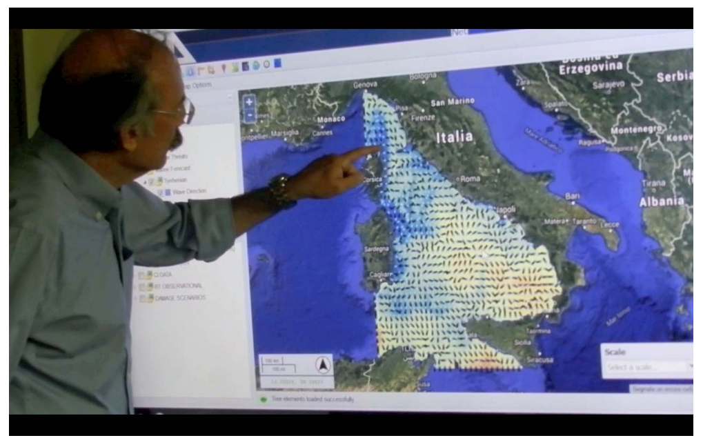
Figure 2: Snapshot from the CIPRNet Dissemination Movie, showing the CIPCast user interface

The video clip will be about 4' 30" as its aim is to encourage the viewer to get in touch with the CI experts in order to have the whole picture and it will have a resolution of 1080p. In the first version the commentary will be only in English and subtitles will not be available. Should it be a strong limitation, subtitles (in English, in the first instance) will be added. The video will be available in the web site <a href="www.ciprnet.eu">www.ciprnet.eu</a>. The Fig. 2-4 below show a few snapshots of the movie.