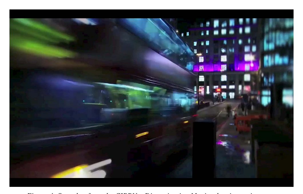
Figure 4: Snapshot from the CIPRNet Dissemination Movie, showing a city scene